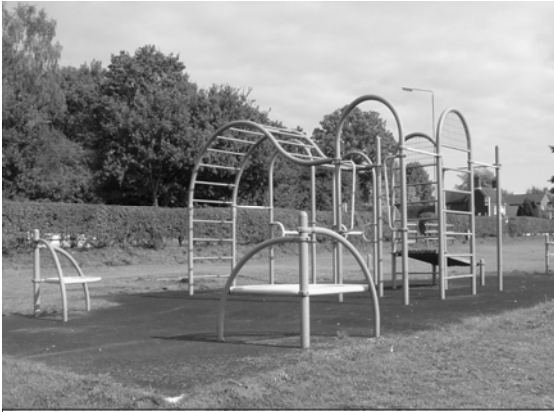
Existing play area - Harpers Recreation Ground

In order to apply for grant funding from other agencies, public consultation is required so your views are important to the Council.