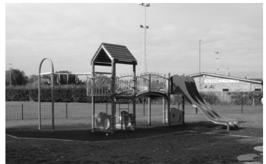
Possible new equipment