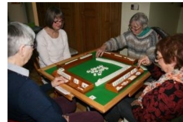
The Ash U3A Mah Jong Group

The next meetings are on 20th June and 18th July.