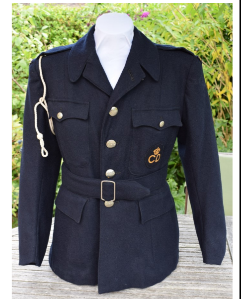
Ash ARP Warden Iris Hawes jacket

The Museums World War Two display features a jacket worn by Ash ARP Warden Iris Hawes, pieces of shrapnel from a 1942 air raid and a stirrup pump used to put out incendiary bombs. Also in the display is an Air Raid Precautions bicycle lamp, issued to Wardens and designed to direct light down towards the ground to stop enemy aircraft from seeing them.