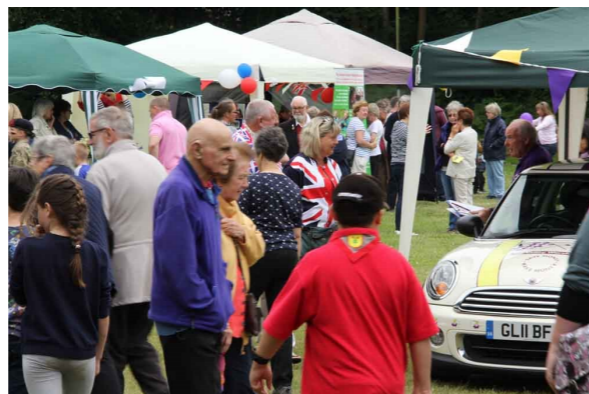
Village Fete 2016

Application forms for stalls can be obtained from the website or via the Parish Office on 01252 32287.