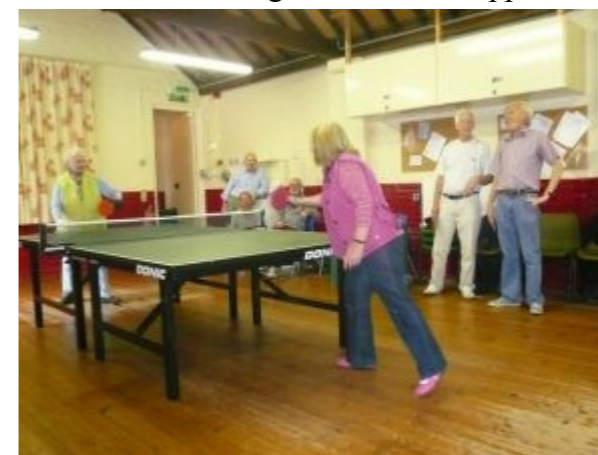
The Ash U3A Table Tennis Group

Arts - Art and Painting for all, Blues Appreciation, Jazz, and Music Appreciation.