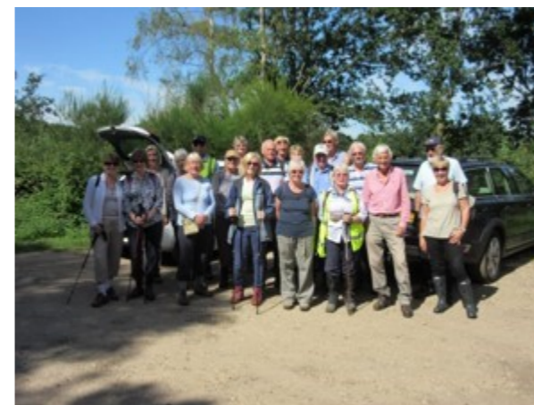
The Ash U3A walking Group

Ash U3A has been in existence for about 16 years and has provided local residents with the opportunity to share interests and activities with like minded people.