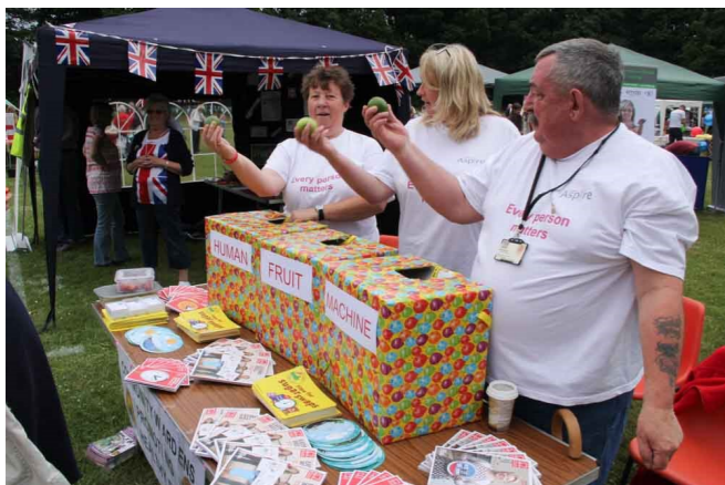
The Community Wardens Human Fruit Machine