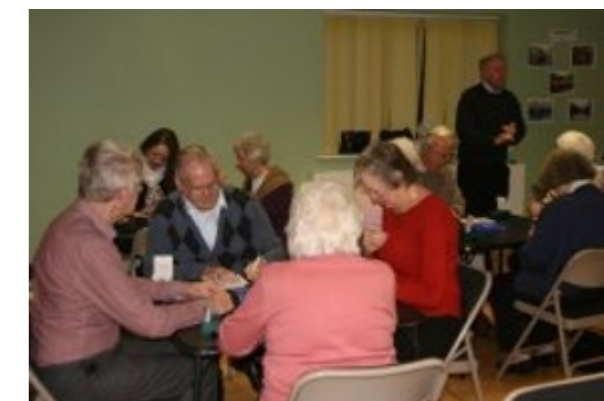
The Ash U3A Bridge Group