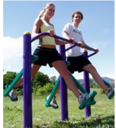
Outdoor fitness equipment in use

One of the main benefits of this equipment is that it is suitable for all ages above 13 years and all abilities. It can be used casually or as the basis for a serious fitness workout. Two or more people can use the equipment at the same time, so friends can work out together.