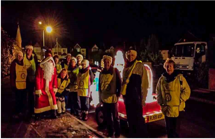
Members of the Ash and Blackwater Valley Rotary Club and the Community Street Team collection volunteers

On behalf of the Ash and Blackwater Valley Christmas float collection volunteers and the Community Street Team, we would like to thank all of the residents from Grange Farm Road through to Longacre and Manfield Road, as well as residents from Oaklea all the way through to Wentworth Crescent areas for your generous donations. A total of nearly £900 was raised and will be distributed to local charities in our area.