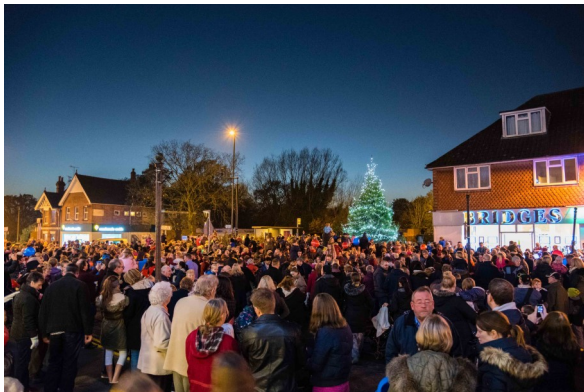
Ash Wharf - Switching on of the Christmas Tree Lights