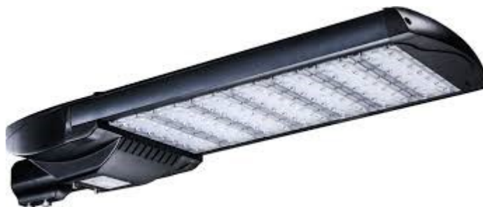
A LED street light similar to the ones trialled by Ash parish Council

A trial has also recently been undertaken with regard to using a more energy efficient LED lantern and as this newsletter is being prepared for printing the results of the trial are under consideration by the Council.