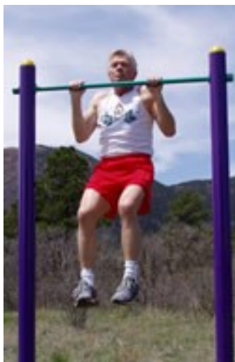
Outdoor fitness equipment in use

Some of the benefits of this equipment is that there are no joining or membership fees, (indoor gyms can be intimidating), they are eco friendly, you can exercise on your own or with a group, it offers a chance to exercise all the major muscle groups and also acts as a community focal point for social interaction amongst friends and between different age groups.