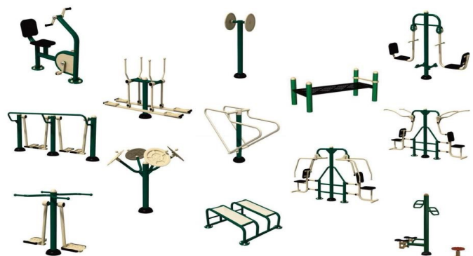
Some of the many types of Outdoor fitness equipment available