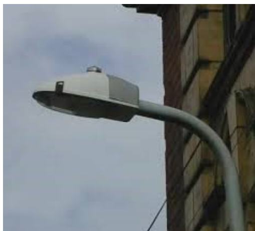
A 5 metre steel column with a 70Watt Riga Lantern

The street light outside your home has failed; who should you contact? The simple answer is Ash Parish Council on 01252 328287 or by e-mail office@ashpcsurrey.gov.uk . Ash Parish Council can then progress the fault with the relevant contractors.