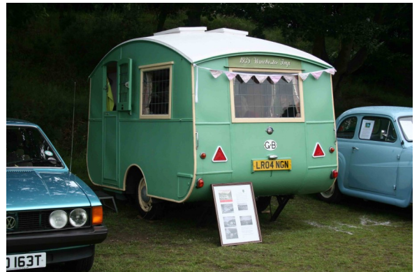
The Classic "Cars"

Inside the Ash Centre there will be the open show classes for Flowers, Vegetables, Flower Arranging, Craft and Baking, with many different classes to suit everyone including a special children's class. All Certificate winners will be