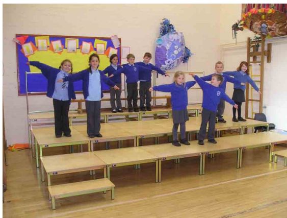
Stage layout similar to the one that Ash Parish Council are obtaining

By the time that you receive this newsletter the Main Hall at the Ash Centre should have had brand new lighting installed. New energy saving LED lights have been installed to replacing the old very energy consuming existing lights. These new lights as well as consuming less electricity will give a more evenly spread light throughout the hall, ideal for badminton and other functions. They are also more “user friendly”, whereby the lights will be capable of being switched on and off at will, rather than waiting for a warming up period when turning on and also a cooling down period, before the lights can be switched back on again following switching off.