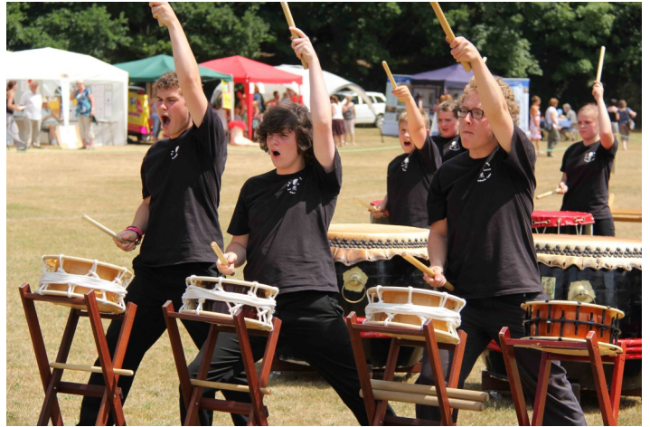
Oku Nojo Daiko Japanese Drummers

Ash Fun Day 2014 is to be held on Saturday 12th July 2014, at the Ash centre and Ash Recreation Ground, and once again we are planning to provide a full afternoon's entertainment. At the time of going to press as well as all the usual stalls, fun, games and Art and Craft Show, we already have a number of confirmed bookings for the Central Arena. This year making a welcome return following the tremendous success of 2013 are the Oku Nojo Daiko Japanese Drummers, who will once again be welcoming some audience participation. Also making a welcome return after a break of a number of years are the Henfold Birds of Prey.