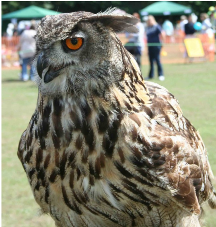
Honey the Eagle Owl from the Henfold Birds of Prey

This year for the first time the Central Arena will also be home to a number of different children's races, including egg and spoon, three legged and so on. ( Items still subject to change ). Another group making a welcome return after a break of a year will be a display of Classic Cars.