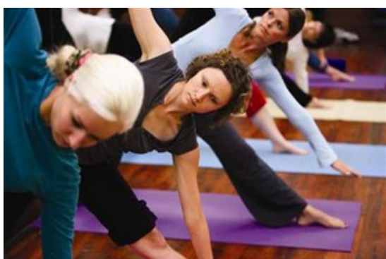
Group Yoga class

During the School holidays Koosa Kids run the Centre's holiday clubs for ages 4 - 13 years, from 8:15am until 6:00pm (shorter days are available). There are a host of fun activities on offer ranging from football, hockey, cricket, go karts, drama, painting, clay moulding and much, much more. The Centre is also able to provide children's birthday parties to include any of the activities offered at the Ash Manor Sports Centre. For more information on Ash Manor Sports Centre or to enquire about any of their activities please contact 01252 325484 or visit the