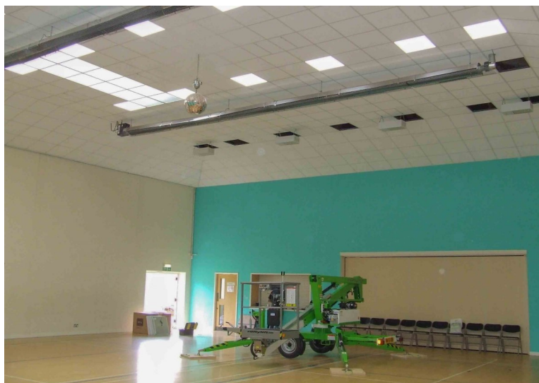
The new LED lights being installed in the Main Hall

For more information on any of the above, please contact Ash Parish Council on 01252 328287 or e-mail office@ashpcsurrey.gov.uk .