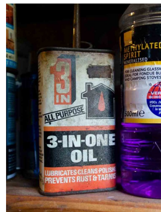
"Something beginning with O"

Recent subjects have included, "My Summer", "Something beginning with O" and "Tempting and Tantalising". They have also introduced a "Talk-About" subject where a member volunteers to show and describe three or four pictures that they found interesting or have influenced their lives.