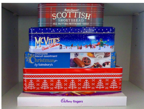
"Tempting and Tantalising"

For the "how to do it" subjects members are encouraged to give a short, informal, talk on a subject in which they have an interest. Care is taken to balance these subjects across the range of experience in the club. Each month they select a subject for a picture review.