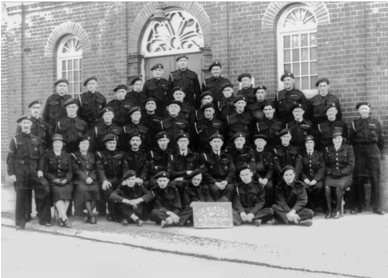
The Ash Wardens 1943

In this special year, when the whole country is remembering the centenary of the start of the First World War, our local history museum will be holding extra events. Entry to all events is free.