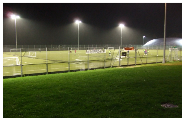
All weather 3G Pitches

Group exercise classes run everyday of the week and include all the favourites such as Zumba - the latin-inspired high energy dance workout, Spinning - a great cardio vascular workout on a stationary bike and Yoga - perfect for building strength and flexibility whilst de-stressing. Classes are a great option for those who enjoy a livelier atmosphere and a more social approach to working out.