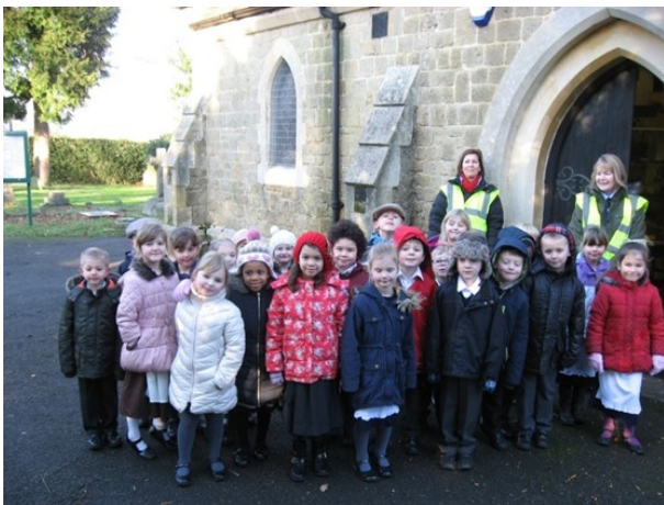
A group of children from Walsh Memorial C of E School outside The Chapel at Ash Cemetery - the home of Ash Museum