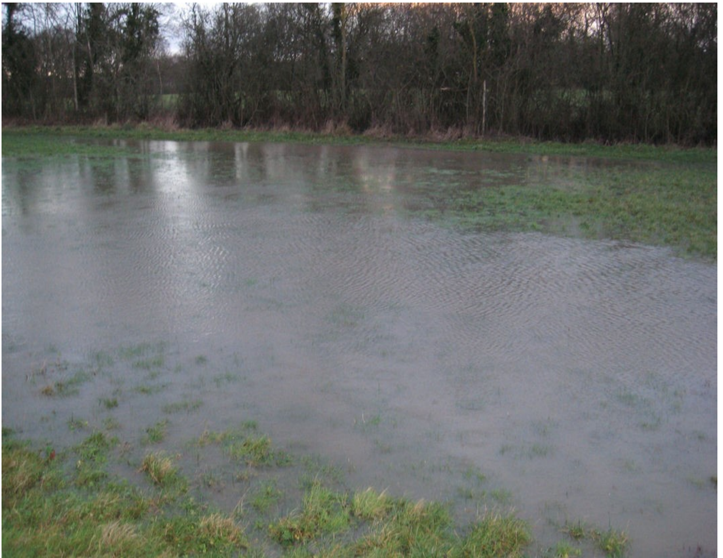
The above picture shows the extent of regular flooding on the proposed site of the 400 homes at land south of Ash Lodge Drive

Ash Parish Council was successful at the oral permission hearing, but the High Court decision was not in our favour at the final hearing. However even though both decisions clearly found that Guildford planning officers did not give Councillors fully correct information, the High Court judge decided that the Committee decision was not flawed overall. Given that the vote in favour of the Planning Application was 18-16 in favour, hardly a unanimous result, and following a review of the published decision Ash Parish Council took additional legal advice and has sought leave to appeal the High Court decision to the Court of Appeal.