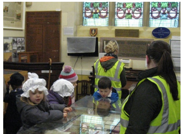
Children from Walsh Memorial C of E School inside The Chapel at Ash Cemetery - the home of Ash Museum

Above pictures by kind permission of The Head Teacher, Walsh Memorial Church of England School