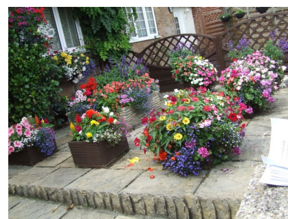
Various entries into ASH in Bloom 2014