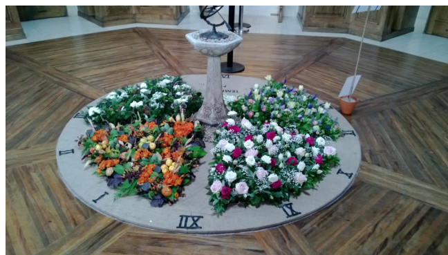
An Ash Floral Club exhibit at the Guildford Cathedral Flower Festival

The monthly demonstration starts at 7:30 and the doors open at 7:00 for those who want go early and have a chat or pick up something from the sales table. There is