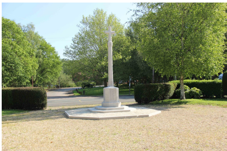
The War Memorial today taken from the same position as the lower photo on the previous page.

Following the recent restoration of the Ash War Memorial, Ash Parish Council will be holding a War Memorial Rededication Ceremony on Sunday 10th August. At the time of going to press the final details of this ceremony are still being formalised. For the most up to date information please refer to the Ash Parish Council website www.ashpcsurrey.gov.uk . The intention is for a parade up Ash Hill Road from the Ash Centre, following which there will be a service of rededication led by members of the local clergy at the War Memorial. This service will include a reading out of the names of the fallen, from both the 1914 - 1918 and 1939 - 1945 conflicts.