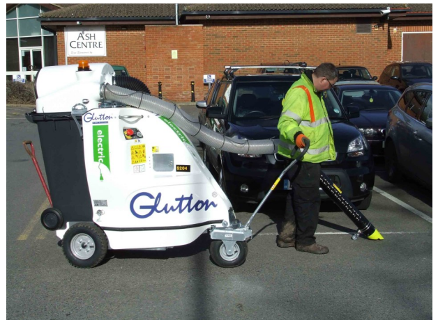
A member of Parish Ground staff putting the Glutton through its paces.

Guildford Borough Council has recently purchased 3 Glutton street sweepers. In partnership with Ash Parish Council, one of the machines is permanently based in Ash and it is operated by Parish staff on a day to day basis. A Glutton is a hand held machine, similar to a vacuum cleaner which sucks up leaves, cigarette ends, even dog mess. It is environmentally friendly as it runs off a rechargeable battery and it is virtually silent which makes it ideal to use in residential areas. Statistics show that a Glutton is 5 times more efficient than manual sweeping. Look out for it on our roads and streets.