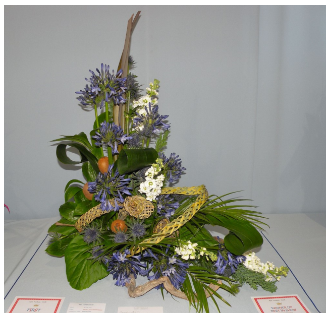
An exhibit from a recent floral show

an interval with tea and biscuits and a further opportunity to chat! They always welcome new members and guests whether to see what the club are about or those who already have some flower arranging experience.