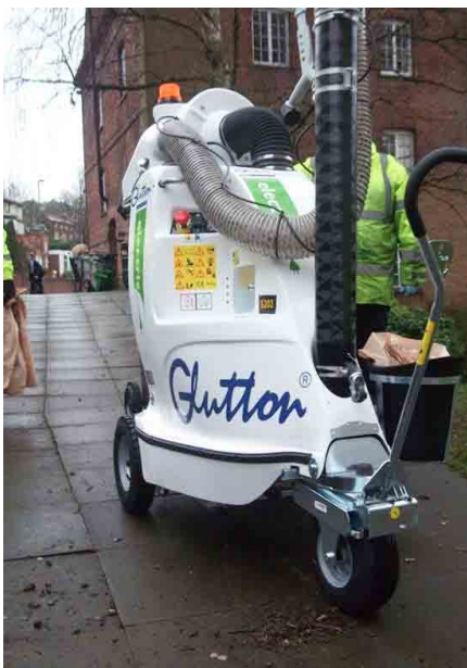
The Glutton Street Cleaner

Guildford Borough Council has recently purchased 3 Glutton street sweepers. In partnership with Ash Parish Council, one of the machines is permanently based in Ash and it is operated by Parish staff on a day to day basis. A Glutton is a hand held machine, similar to a vacuum cleaner which sucks up leaves, cigarette ends, even dog mess. It is environmentally friendly as it runs off a rechargeable battery and it is virtually silent which makes it ideal to use in residential areas. Statistics show that a Glutton is 5 times more efficient than manual sweeping. Look out for it on our roads and streets.