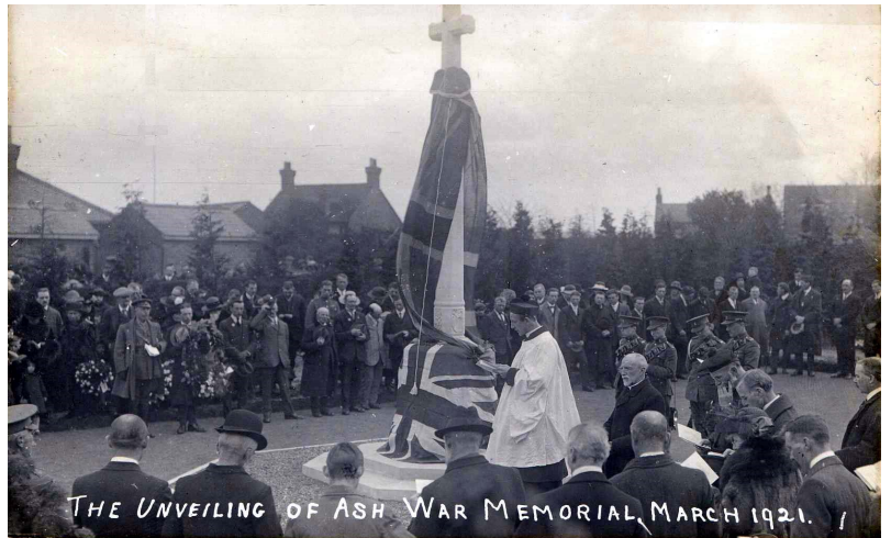
The Unveiling of the Ash War Memorial March 1921 *.