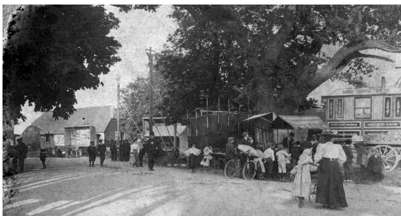
Fairs were held annually on the green outside the Greyhound every June until 1914. Then they stopped for the First World War and never resumed. This picture was taken in 1912.