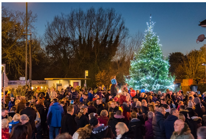
Fantasia 2014 on Ash Wharf

Christmas Fantasia 2015 will be on Saturday 28th November . The event will start at 2:00pm in the Ash Centre with the now traditional Christmas Fair, with its many tombola's, games and raffles. Refreshments will be available throughout the afternoon.