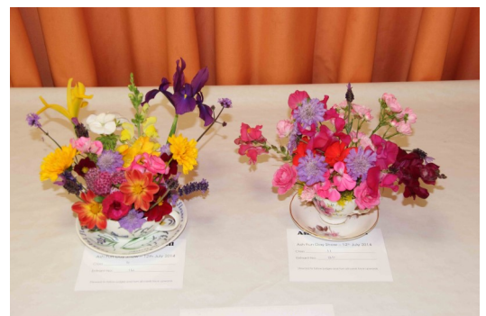
Flower Arranging exhibits from Fun Day 2014

Full class details and instructions, together with entry forms can be obtained from www.ashpcsurrey.gov.uk , or by telephoning 01252 328287 or directly from the Ash Centre, Ash Hill Road, Ash. Certificate winners will be invited to receive their certificates at the Ash in Bloom Presentation Evening to be held on Friday 18th September at the Ash Centre.