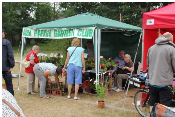
Ash Parish Council Village Fete 2017

This year's Ash Parish Council Village Fete is to be held on Saturday 14th July at the Ash Centre and Recreation Ground, Ash Hill Road, Ash. The Fete will be open from 12:00 noon until 4:00pm.