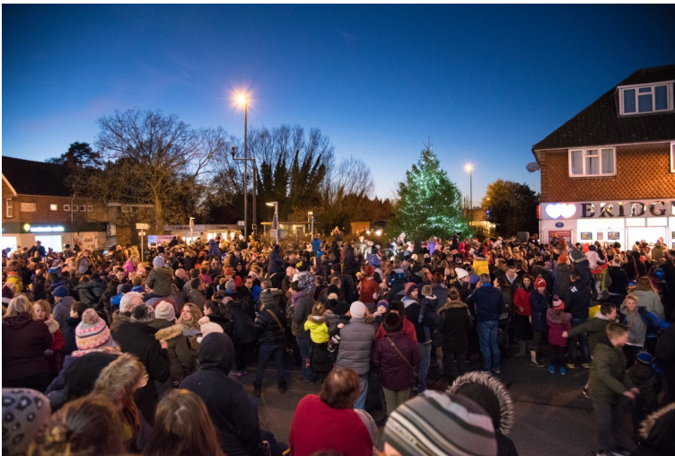
Ash Wharf - Fantasia 2017

The 2018 Ash Parish Council Christmas Fantasia will be held on Saturday 1st December. The event will open with the traditional Christmas Fair at the Ash Centre from 2:00pm until 6:00pm. There will be a wide range of games, tombola's and gift stalls for those elusive Christmas presents. Refreshment will be available throughout the afternoon.