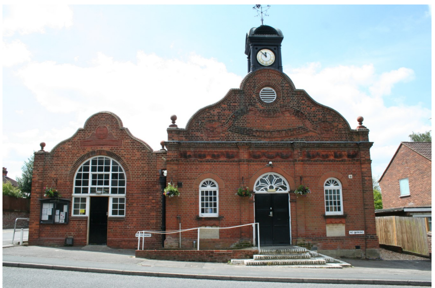
The Victoria Hall, Ash Hill Road, Ash

If you have any questions or queries with regard to the Electoral Register or the Elections please visit https://www.guildford.gov.uk/elections .