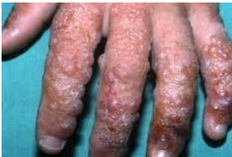
The Effect of Toxocariasis

We make no apology for raising the issue once again, but there has been another increase in the amount of dog fouling that is taking place that is not being cleared up by the dogs owners. As well as being unpleasant, dog mess is also unhygienic and a major health hazard. The key issue here being that dog faeces can lead to toxocariasis in humans, and in particular children where it can cause blindness.