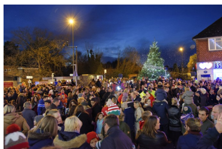
Christmas Fantasia 2018

Following the service the congregation will parade back to the Ash Centre for formal dismissal following which tea and coffee will be available in the Ash Centre. For further details please contact the council on 01252 328287 or visit https://www.ashpcsurrey.gov.uk/remembrance-sunday-service-and-parade-2019/ .