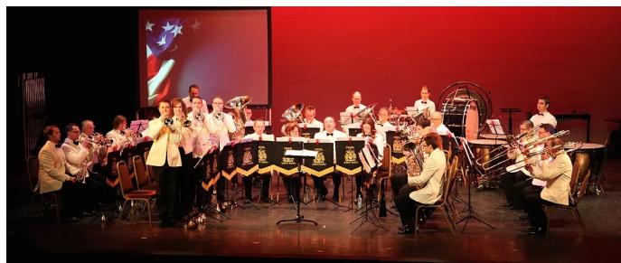
The Friary Brass Band

Further details will appear on the Council website www.ashpcsurrey.gov.uk when available.