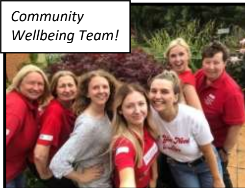
Community Wellbeing Team!

Don't forget, we are now live with our blog and posting regularly! You can now catch up with the whole gang in one place, follow us today!