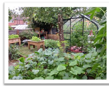
Best Veg Patch (Lindia Cizewska)