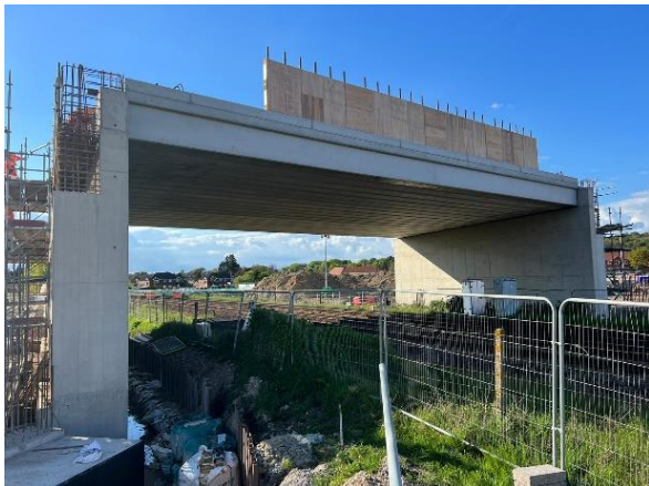
The new bridge

Ash residents have a chance to go down in local history by choosing a name for their new bridge. We're confident that someone will come up with a name that chimes with the rich history, diverse environment and great community in Ash. So, for inspiration, think about local historical events or people, plants, trees or animals as well as what goes on in Ash. The winner will receive a £50 voucher. Two runners-up will get a £25 voucher and a donation of £100 will go to a local charity. For more information, the competition rules and to enter, please visit our website. You can also enter the competition using the QR code below. Please get your entries in by Friday 19 July.