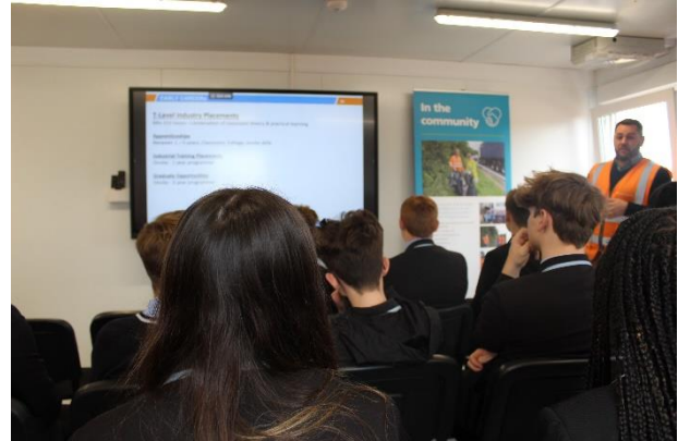
Discussing career opportunities

In July, four students from Ash Manor School will be gaining work experience on site. They will spend four days getting a glimpse into how a construction project works.