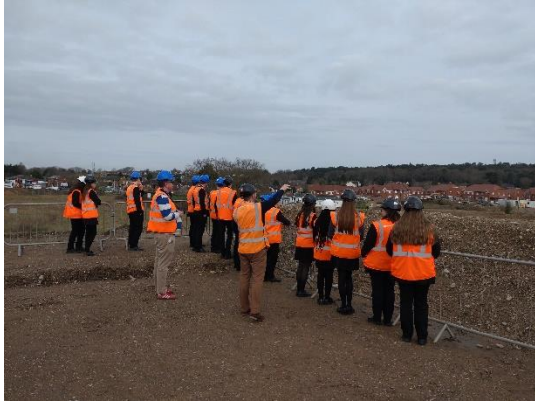
Ash Manor pupils seeing the site