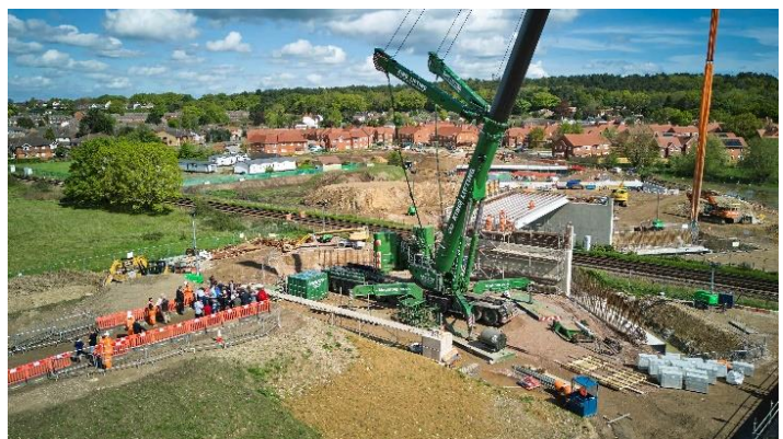
People watching the work